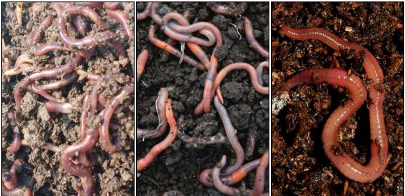
Figure 1. Tiger Worms, the African Nightcrawler, and Indian Blue Worms

Worms have various predators including birds, snakes, small mammals and invertebrates. Predators of particular relevance for tiger worm toilets are mice, rats and centipedes, and care should be taken that they are not able to access the tank.