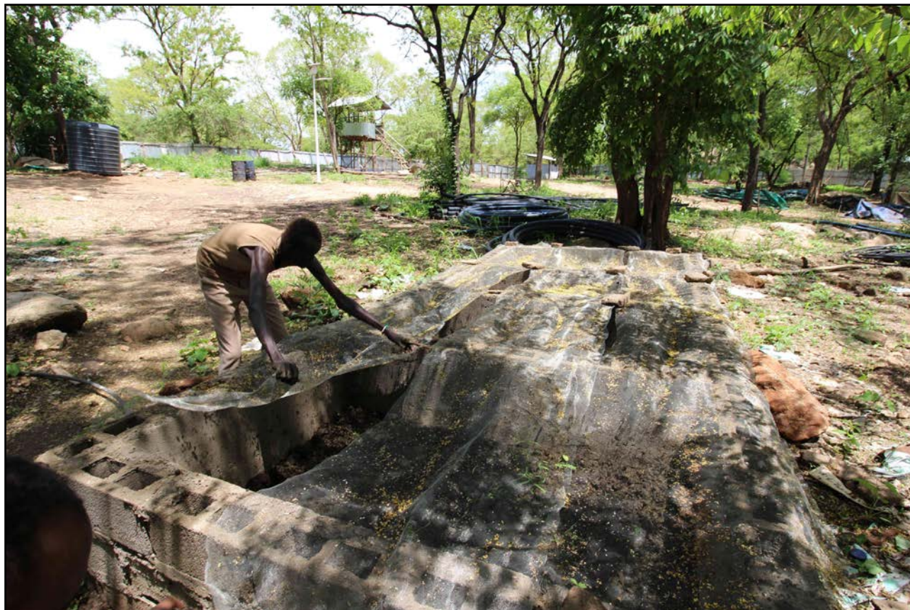
Figure 3. A wormery in Gambella.

To continue growing worms in the wormery, do not harvest all of the worms at the same time. The material the worms are harvested from will also contain worm cocoons, so this should be returned to the wormery after the worms have been harvested from it.