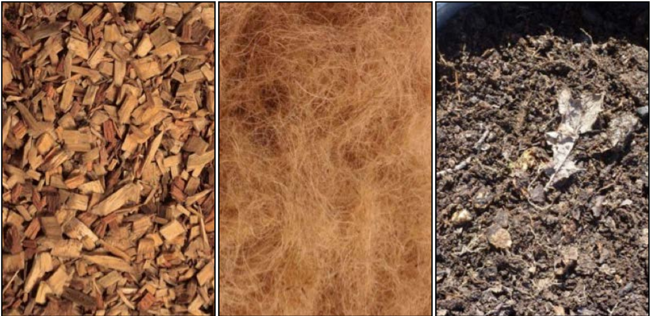
Figure 2. Possible bedding layers: woodchip, coconut fibre (coir) or compost.

A bedding layer is necessary for the worms to live in whilst they are in the toilet. A good bedding material should retain moisture, retain its (porous, air-retaining) structure to prevent the toilet going anaerobic, and filter out the solids that are flushed. Possible bedding layers include woodchip, coconut fibre (coir) or compost (Figure 2). Lab tests have shown that woodchip may be the most effective bedding layer, although if it has too many fine particles then this could potentially cause clogging. Whichever bedding layer is chosen, it should be soaked overnight before installation in the toilet and be added at the same time as the worms to a depth of around ten centimetres.