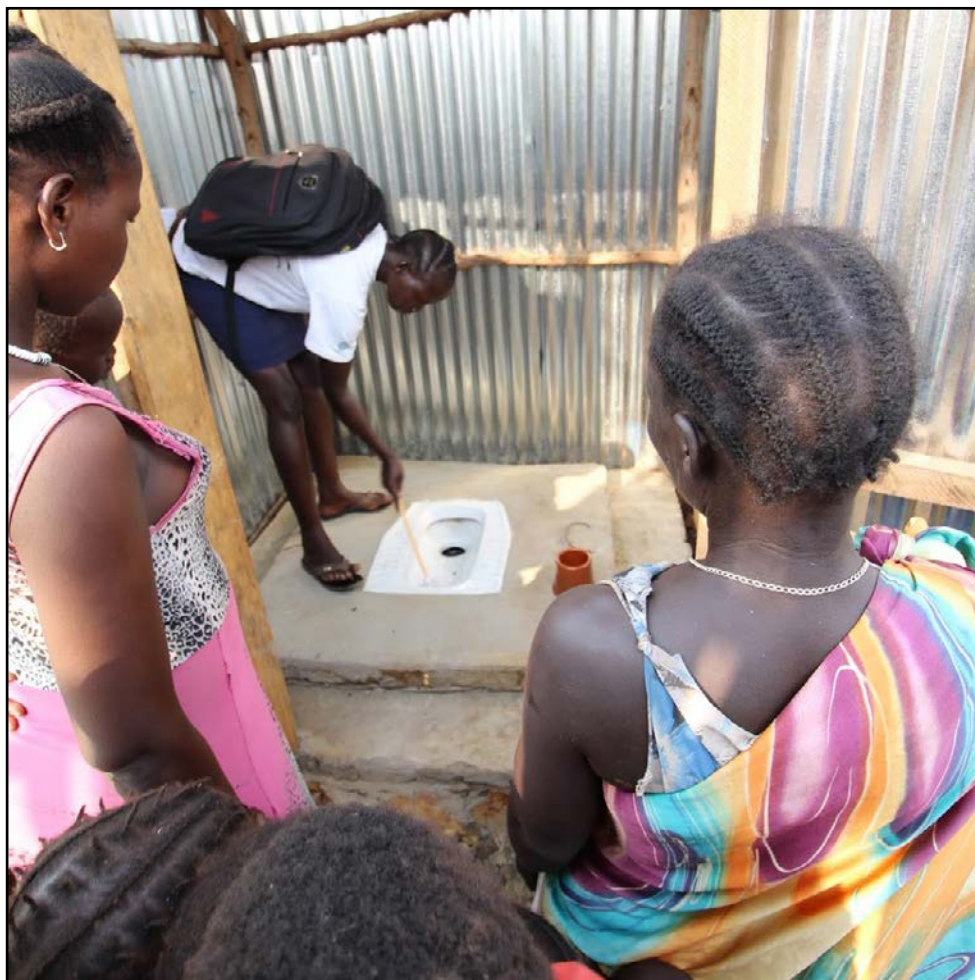
Figure 4. A demonstration of how to clean a Tiger Worm Toilet in Gambella.