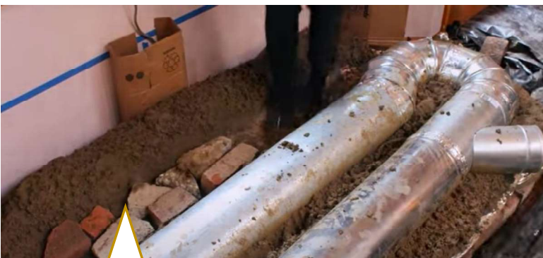
From rubble to heat-holding mass