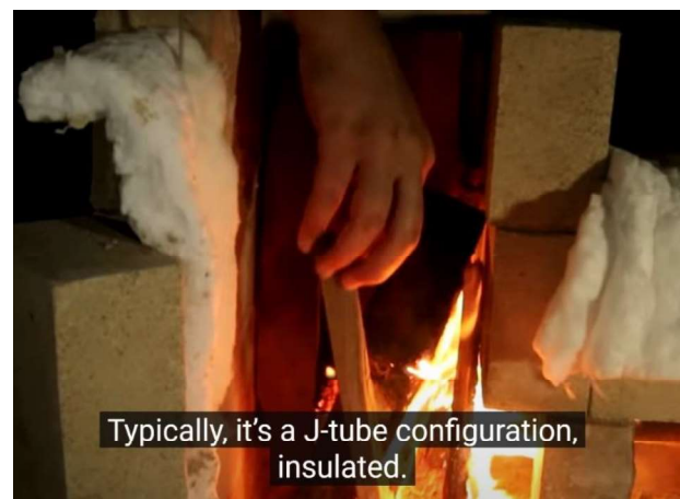
Typically, it's a J-tube configuration, insulated.

Cost? from almost nothing to as much as you want to spend!