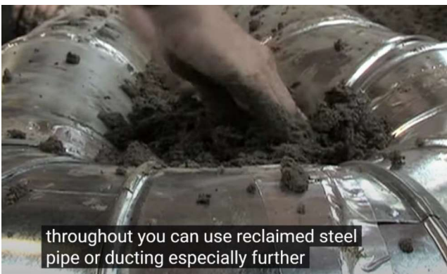
throughout you can use reclaimed steel pipe or ducting especially further